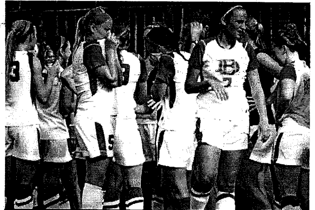
Dallas Baptist University Girls grouping after the goal

The Dallas Baptist girls had several changes with players who had been already