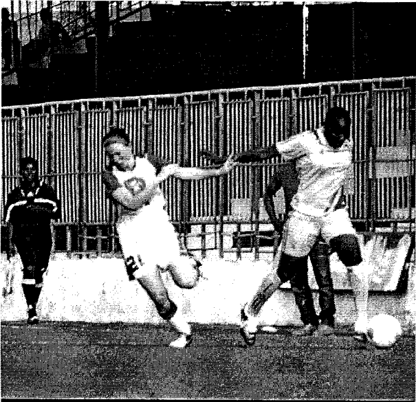
All Stars' striker winning the ball from Dallas University Girls in their exciting match yesterday.

The two teams had met on Sunday, May 26 at the Antoinette Tubman Stadium, the same venue for